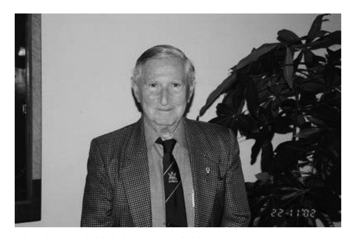
"The further you can look back, the longer you can look forward."