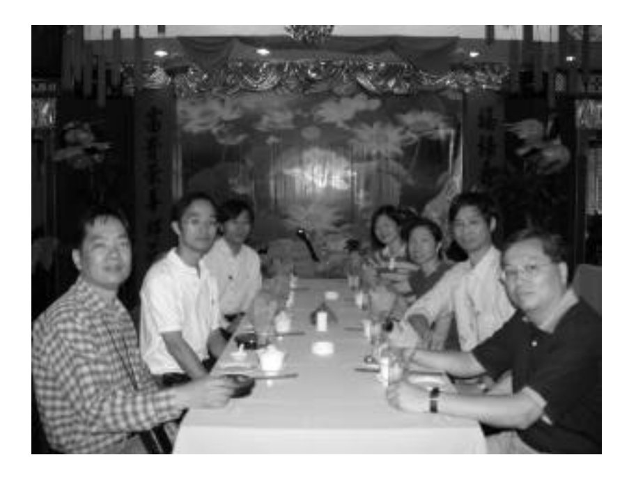
Annual meeting of the Chinese Society of Anaesthesiolog y in Nanjing 14<sup>th</sup> September to 16<sup>th</sup> September, 2002