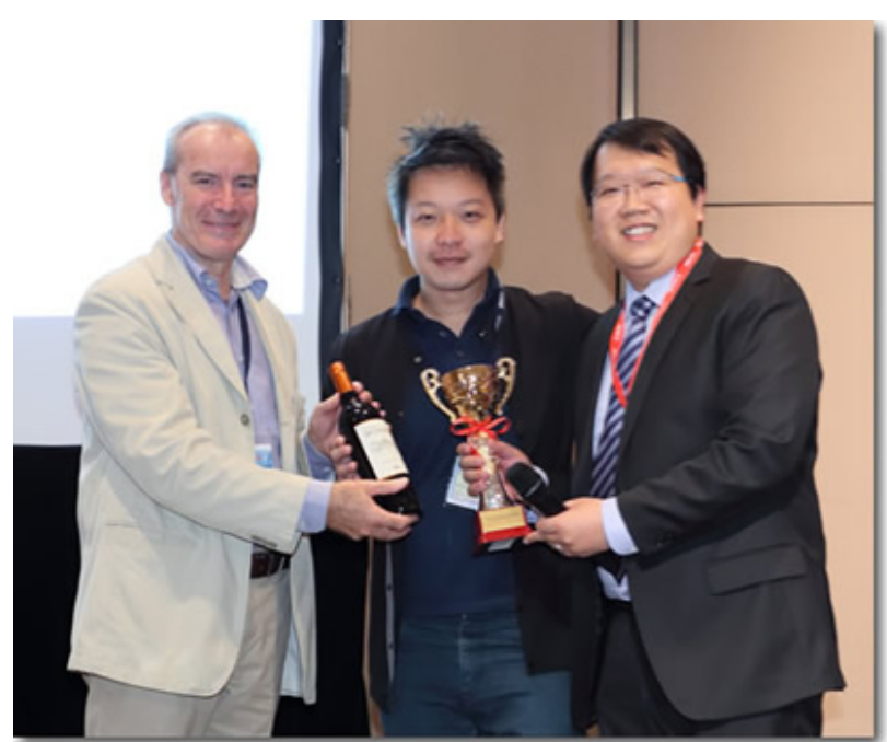
Judges' and Audience Prizes for the Best Team: Kowloon Central Cluster