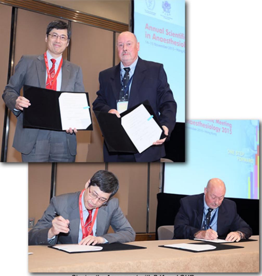
Signing the Agreement with BJA and OUP