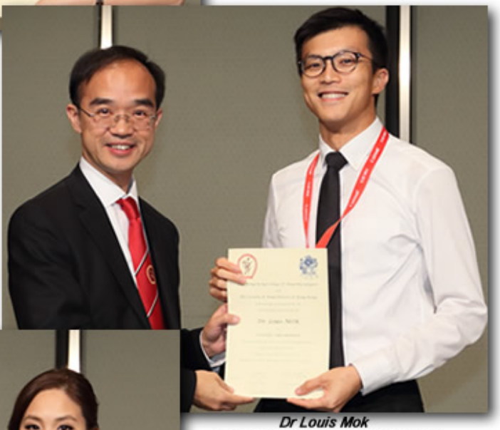
Colontific Subcommittee Homber